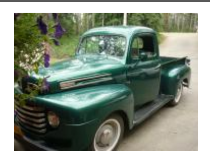
1948 Ford F 1 pickup with 279 cubic inch V-8 engine and 6 volt electrical system. Engine has been overhauled and burns no oil and has great oil pressure. Oak planking in bed has been recently replaced. Metallic green in color. Asking $12,000 OBO. All gauges working. A great truck!! Reason for selling: storage in winter has become too difficult.