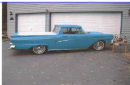
1957 FORD RANCHERO "A CLASSIC RESTORATION"

Model 66 B w/25K Miles on Driveline 302 V-8 Engine w/C-4 Automatic Transmission Power Brakes (front disc) & Cruise Control Turquoise Exterior w/White Roll & Tuck Interior Electric Wipers--Tinted Glass--Padded Dash Ground Effects Lighting--Tonneau Cover A Great Cruiser and a Multiple Trophy Winner