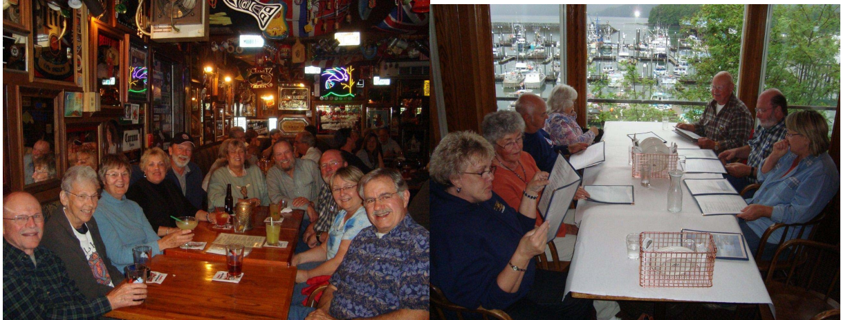
Dinner at the Double Musky at Alyeska Resort