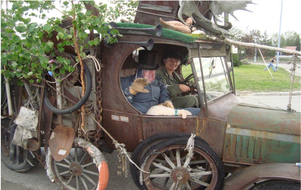
Golden Days Parade Photo