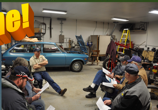
Work Team Assembled