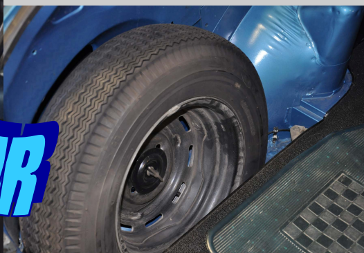
The Original Spare Tire