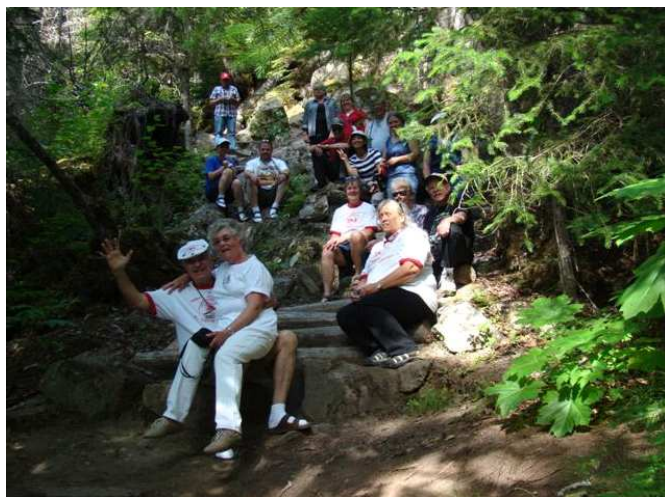
Group photo: On the Chilkoot Trail