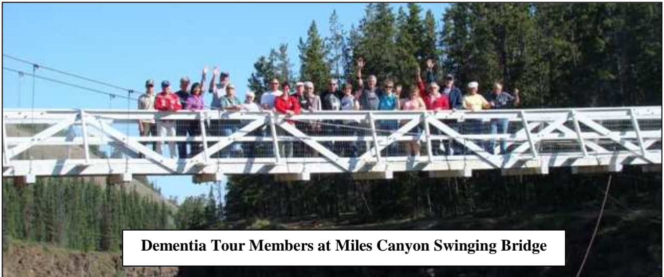
Dementia Tour Members at Miles Canyon Swinging Bridge