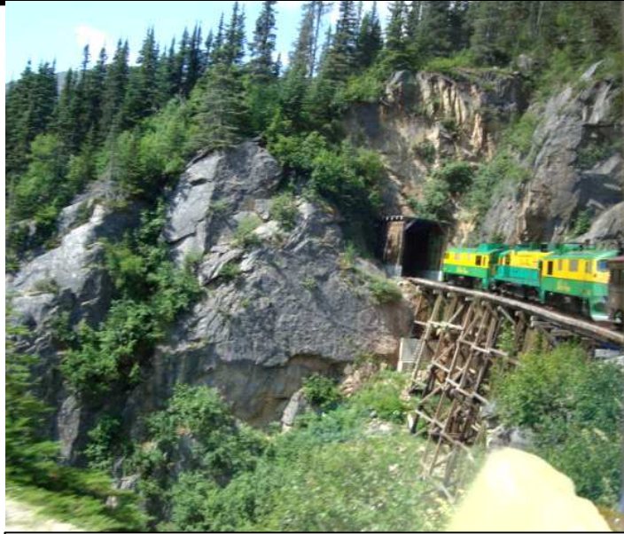
The White Pass Railroad trip from Skagway was a memorable experience. This photo shows the engines of our train going over a wooden trestle into a tunnel.

“short” walk through the bug infested forest from the Chilkoot trailhead to the Slide Cemetery. He later explained that he recalled it as short trek. Well, it was compared to their hike of the entire Chilkoot Trail in 1977!