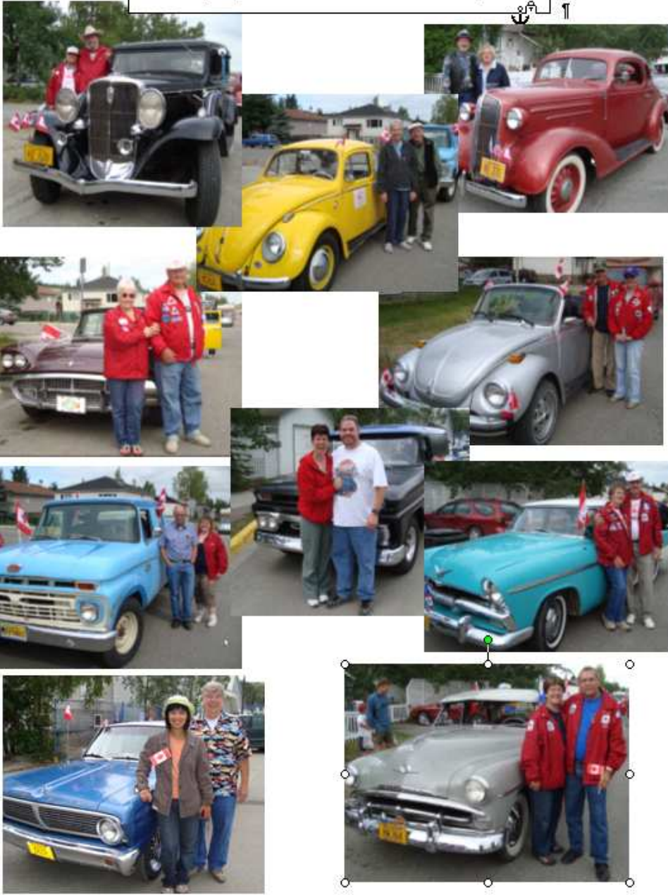
Adventure Before Dementia: All VLNAAC members and their cars just prior to the Whitehorse Dominion Day Parade.

Hansen heard “oldest first” she thought she was going to have to lead the parade! But the Larrick’s beautiful ’32 showcased our vehicles and Bub brought up the rear with our new club banner displayed on his tailgate. The celebration continued at the Rotary Park where we displayed our cars & the locals thanked us profusely for coming. Love those Canadians, eh? The negative of the day was when Theresa mashed her thumb with her truck door- ouch!