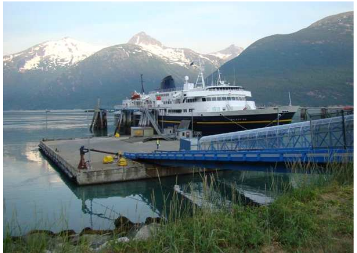
Our ferry from Skagway to Haines