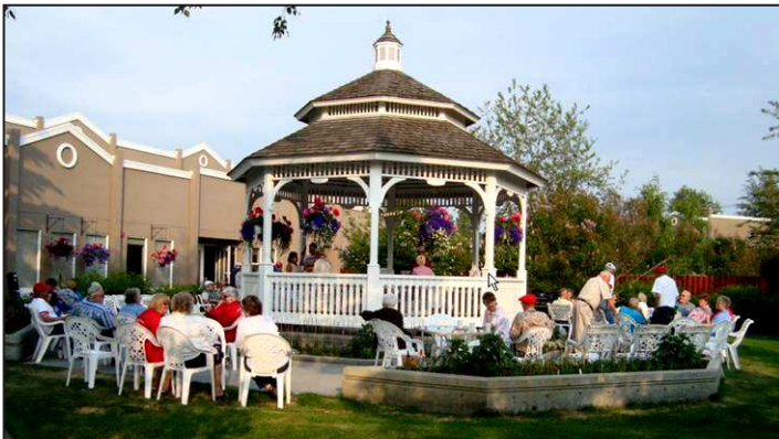
The barbeque picnics were held at the Wedgewood Pavilion.

The joint meet with the Anchorage Mushers and the VLNAAC was a great success. The food at both Friday night and Saturday noon barbeques was excellent with a great variety of salads, side