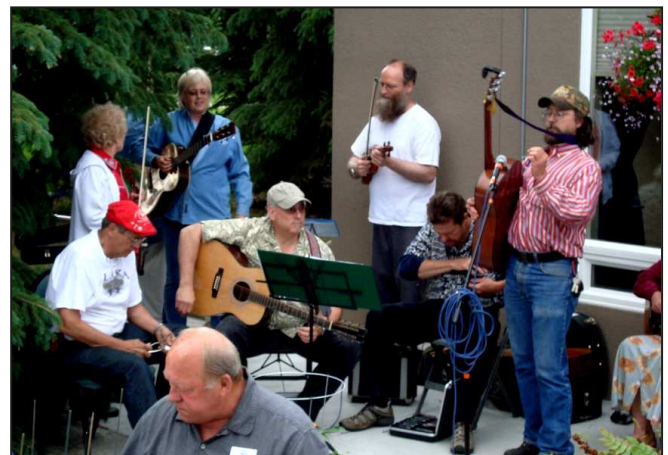
The Pioneer Park Pickers provided bluegrass music for the Friday night barbeque.