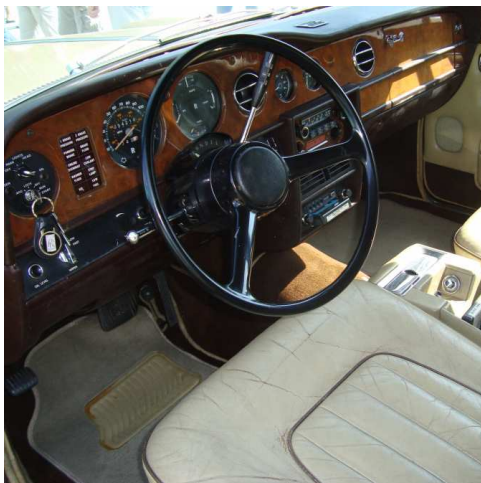
The interior of the Rolls sports a wood grain dashboard panel and leather seats.

A small group of club members attended the Pioneer Park opening on Saturday May 23 with their cars in Pioneer Village. The sun was shining and the temperature very comfortable. We enjoyed live music from the Old Town Pavilion and a steady stream of old car admirers passing by.