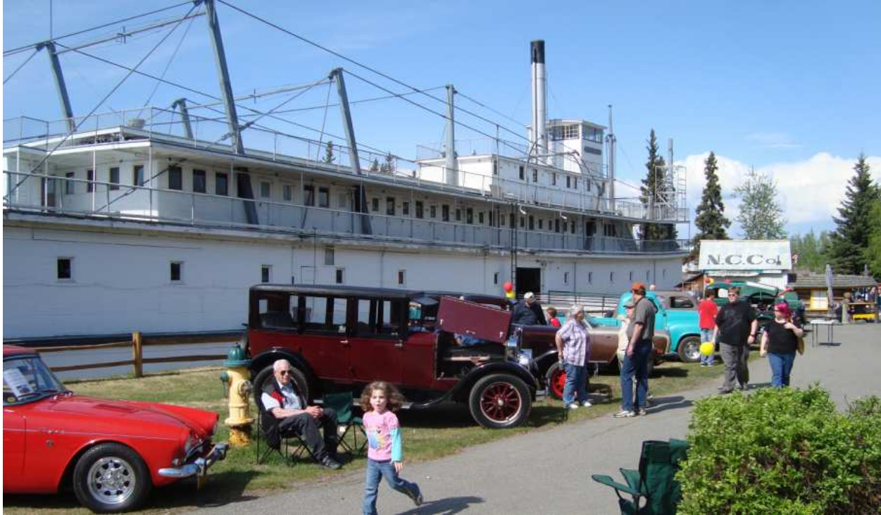
Saturday May 23 was a beautiful day at Pioneer Park. The Riverboat Nenana makes an appropriate background for the vintage VLNAAC cars.