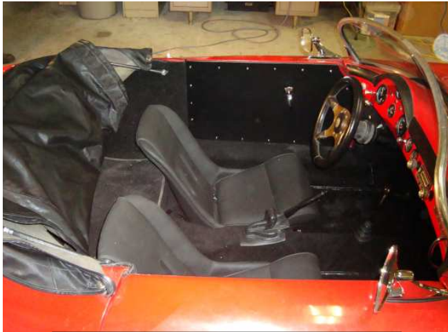
New Seats are installed along with new carpeting and door panels.