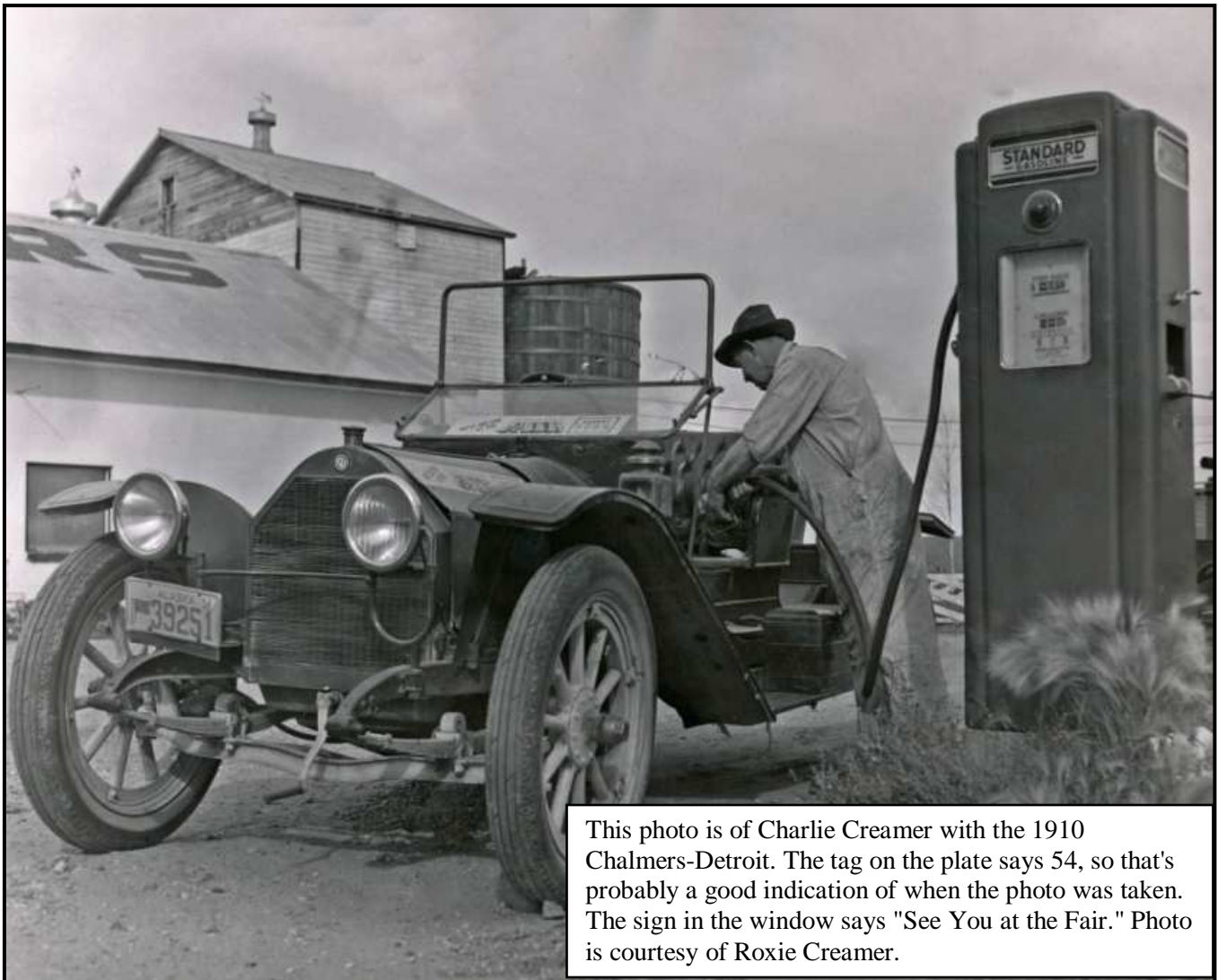
This photo is of Charlie Creamer with the 1910 Chalmers-Detroit. The tag on the plate says 54, so that's probably a good indication of when the photo was taken. The sign in the window says "See You at the Fair."