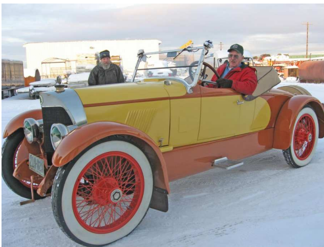
This is a 1920 Argonne Roadster. It has a Rochester/Deussenberg engine. Only 24 Argonnes were made, and this is the last one.

bitter cold as we unstrapped and pushed the newly arrived old cars from the trailers to inside their temporary new warm storage area on November 1. There were a total of nine cars loaded on the two enclosed trailers that brought the cars up from the lower 48 states. We all shared a sense of pride and ownership in working with these beautiful classics.