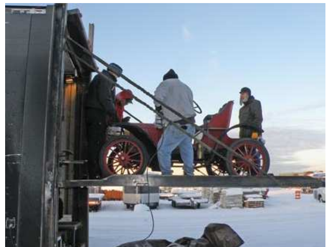
1908 Brush being unloaded that once belonged to silent screen star Gilda Grey.

Unloading the new shipment of classic old cars from the container trailers at below zero temperatures for volunteers Rick Larrick and