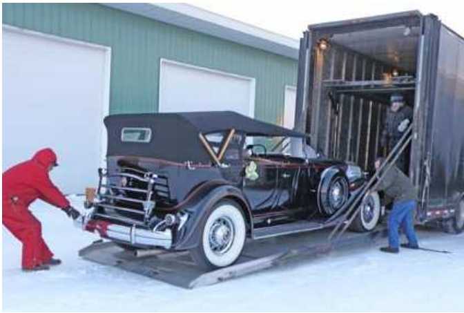
This Packard is heavy, and those pushing it agreed.