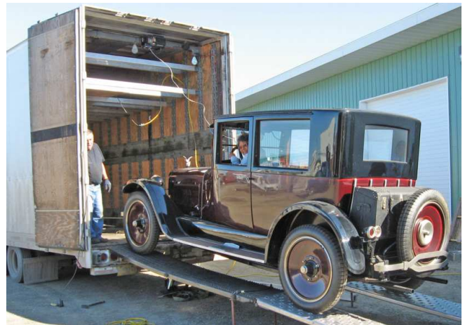
Fountainhead's 1922 Wills St. Clair sedan comes off the truck.

August was a busy month for Fountainhead Development's Antique Auto Collection! Work on the new exhibit hall crept forward, with concrete pours, water line installations, and inspections taking up most of the month. We did get to spend one morning unloading two truckloads of cars, including our 1907 Ford Model K Roadster. We put this car through a full restoration last winter before showing it at the Amelia Island Concours d'Elegance in Florida in March. It's a very impressive car and we are looking forward to displaying it.