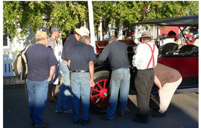
An open hood draws men, especially if it is on a really classy car. This is a Pierce Arrow, a newly arrived car in the Fountainhead Museum collection that made an August Runaround.