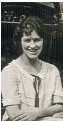
Here is a closeup view of the lady on the running board above.