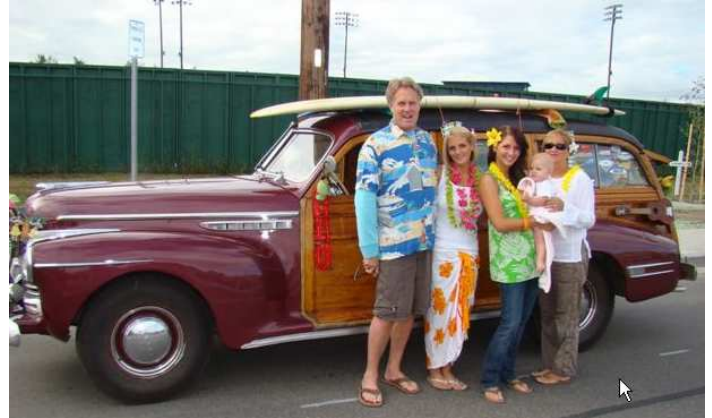
Golden Days: The Barney Party Animals