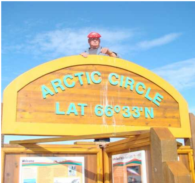
Dempster Highway: The Oldest Kid Among Us