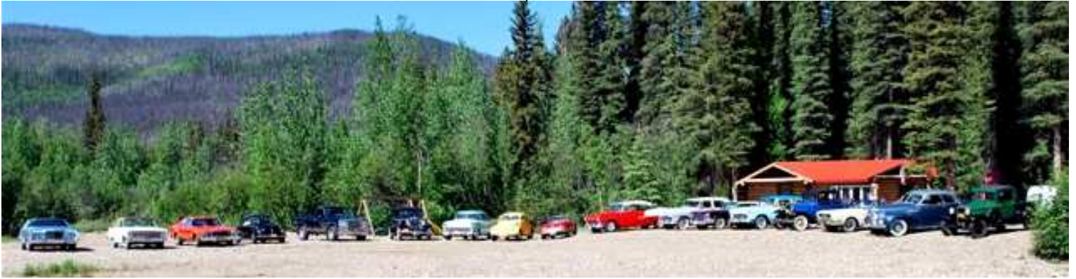
June 14 Poker Run picnic at Gary and Jill Nash's cabin on the Chena River