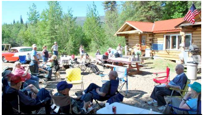
Picnic at the Nash's