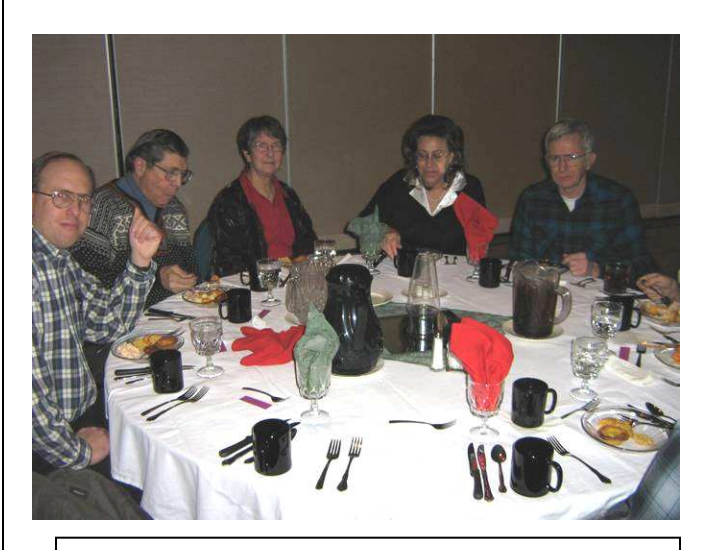
Members enjoyed a great meal with friends and a properly set table.