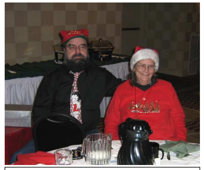
"Properly clothed for a festive Christmas occasion"