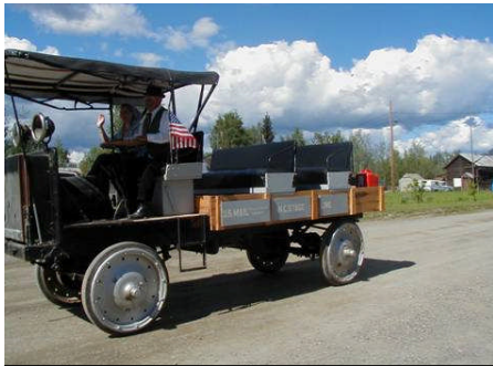
4WD Jefferies in Eagle, Alaska

gathered at the old School for refreshments and various activities. Then we were all invited to a potluck at a friend's home.