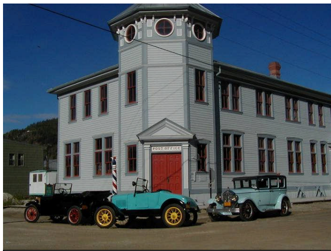
Dawson City Post Office