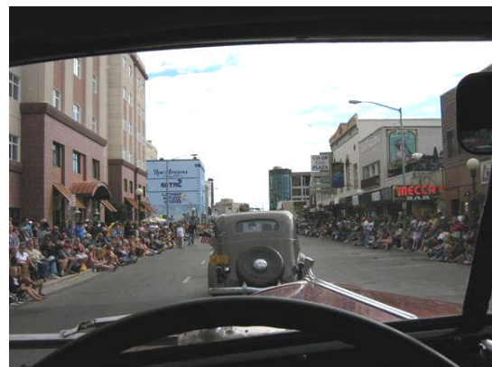
Second Avenue Judging Area as seen from the Driver's Seat