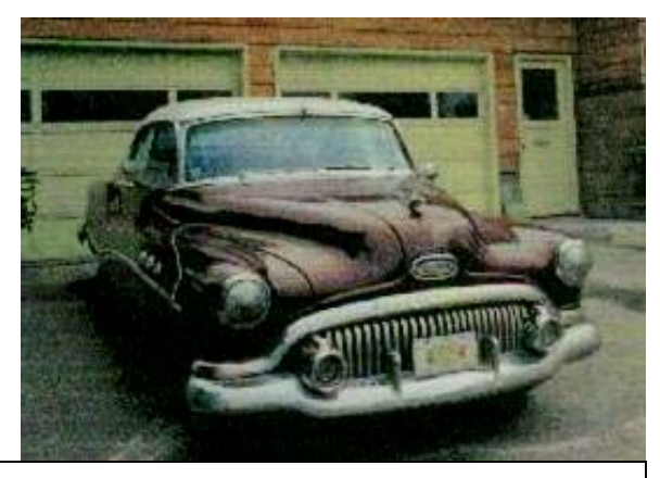
Buick for sale. See above.

1951 Buick, 2-door hard-top, deep maroon w/white top. 88,000 miles. New interior, good tires, fender skirts and more. Cruises at 80 easily. Original body in good solid shape, needs minor cosmetics. Located in Anchorage. Contact Bernie in Fbks. 457-3302, Dick in Anch. 272-5696, or Dell in Anch. 562-4088.