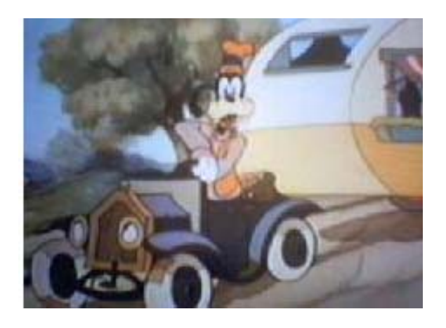
Mickey's Trailer (Disney 1938)