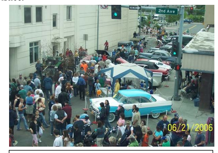
VLNAACF Area at the Solstice

The 2006 Solstice Celebration held downtown Fairbanks drew record crowds of people this year. A great time was had by VLNAACF club members running the root beer stand, tending our historic cars displayed on Lacey Street and chewing the fat with old friends and inquiring passers-by. It is probably my favorite event when the weather is nice, which it usually is on the Solstice.