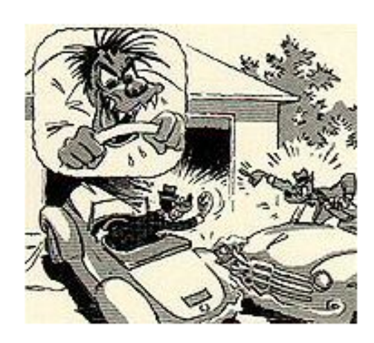
Motor Mania (Disney 1950)