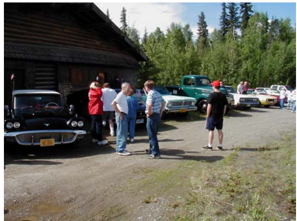
Lining Up for 4 th of July Parade, North Pole