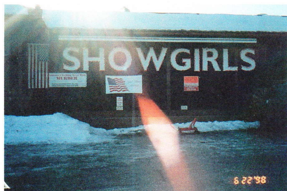
"Gavel wants to have fun!"