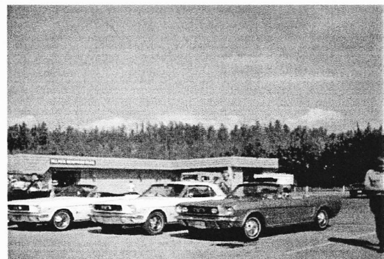
Fords really did rule – here are the 3 Mustangs that came – 1 from Fairbanks & 2 from Anchorage.