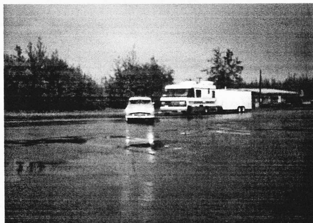
Along the highway coming into Nenana.

tho we have red faces about a Plymouth pulling 2 Fords. Thanks a bunch guys!."