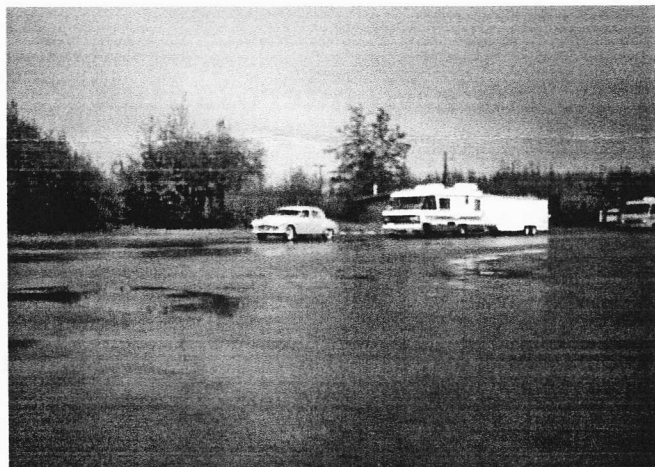
Turning into the Chevron Station at Nenana.