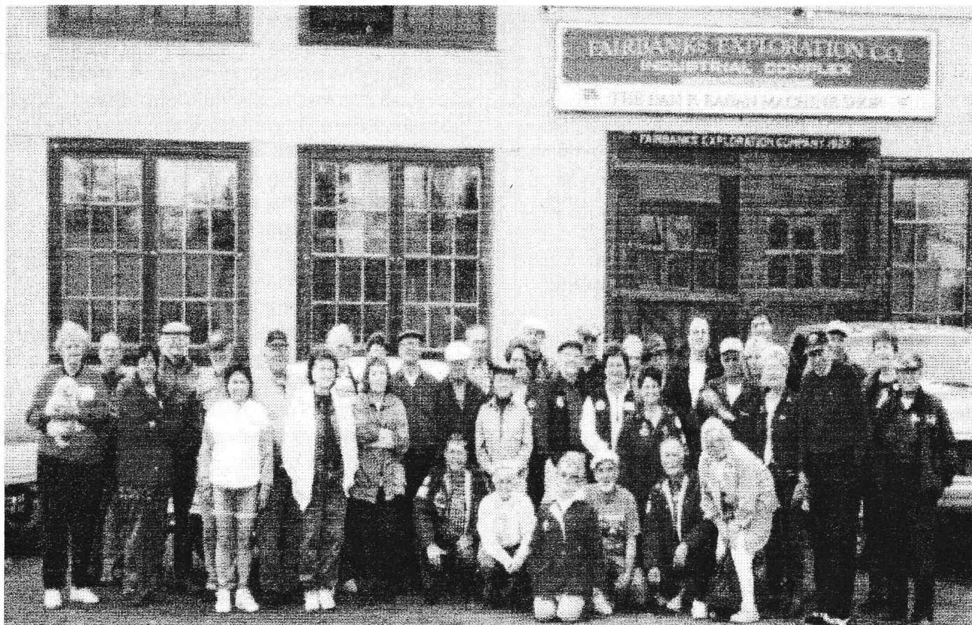
The Gang at the Old FE Company

*if I've missed your special day call Sherry Camarata at 488-4293.