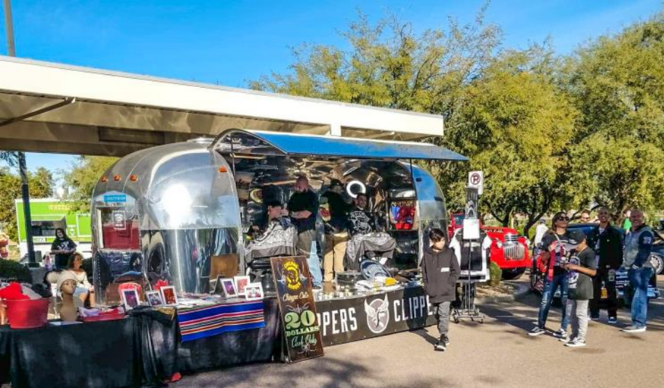
Nipper's Clippers' portable mobile hair-cut shop