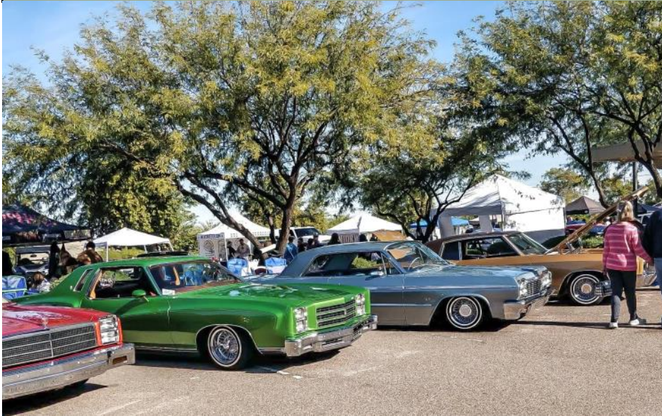
Lines of low-riders

Due to the quarantine, I will only be posting inside jokes.