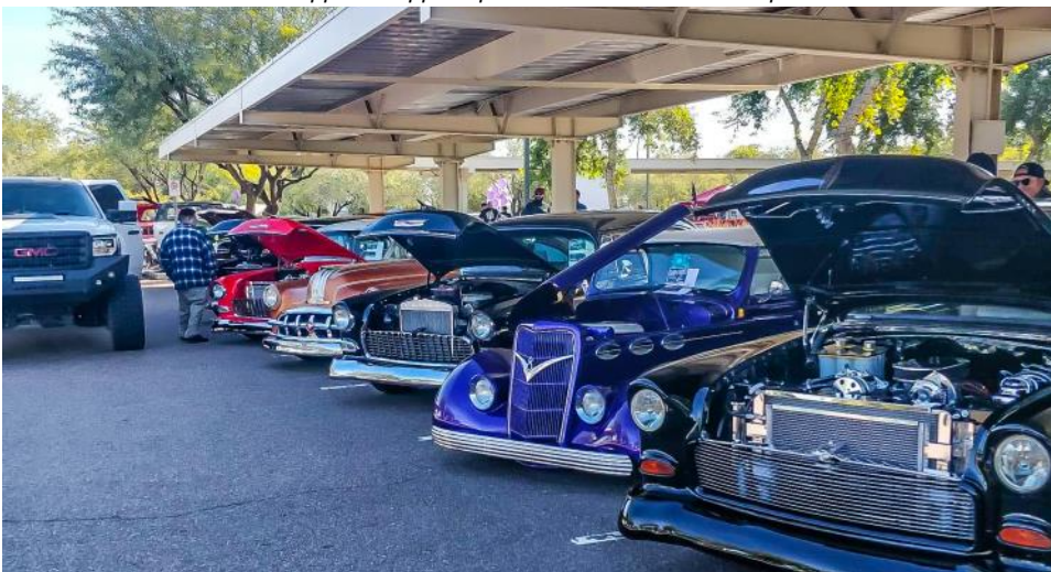
Over 450 cars were displayed