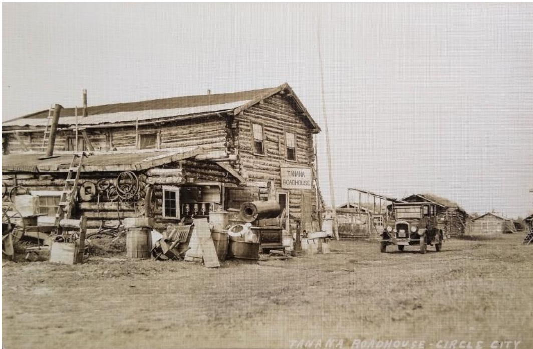
Tanana Roadhouse at Circle City, Alaska