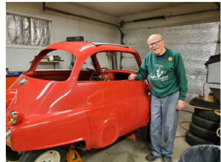
See Page 11: Works in Progress

The Board Meeting is Tuesday, January 7th - at Denny's Restaurant Miner's Room . Meeting starts at 6:30 pm, with dinner before. Board Meetings are open to members.