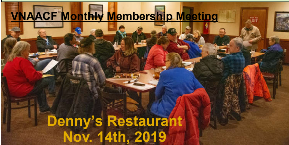
Denny's Restaurant Nov. 14th, 2019