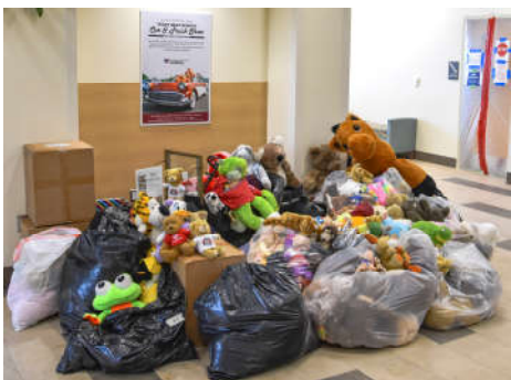
Piles of stuffed animals delivered to the Fairbanks Memorial Hospital Pediatrics Ward in 2019.