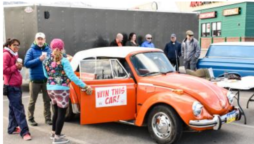
The raffle car drew attention and many tickets sold.

We had a good turn-out from both clubs for the Mothers' Day Healy 100th Anniversary Car Show, and a couple of us Fairbanks folks tagged along for the drive on the Denali Park Road. We had great weather, saw the mountain, and saw some wildlife.