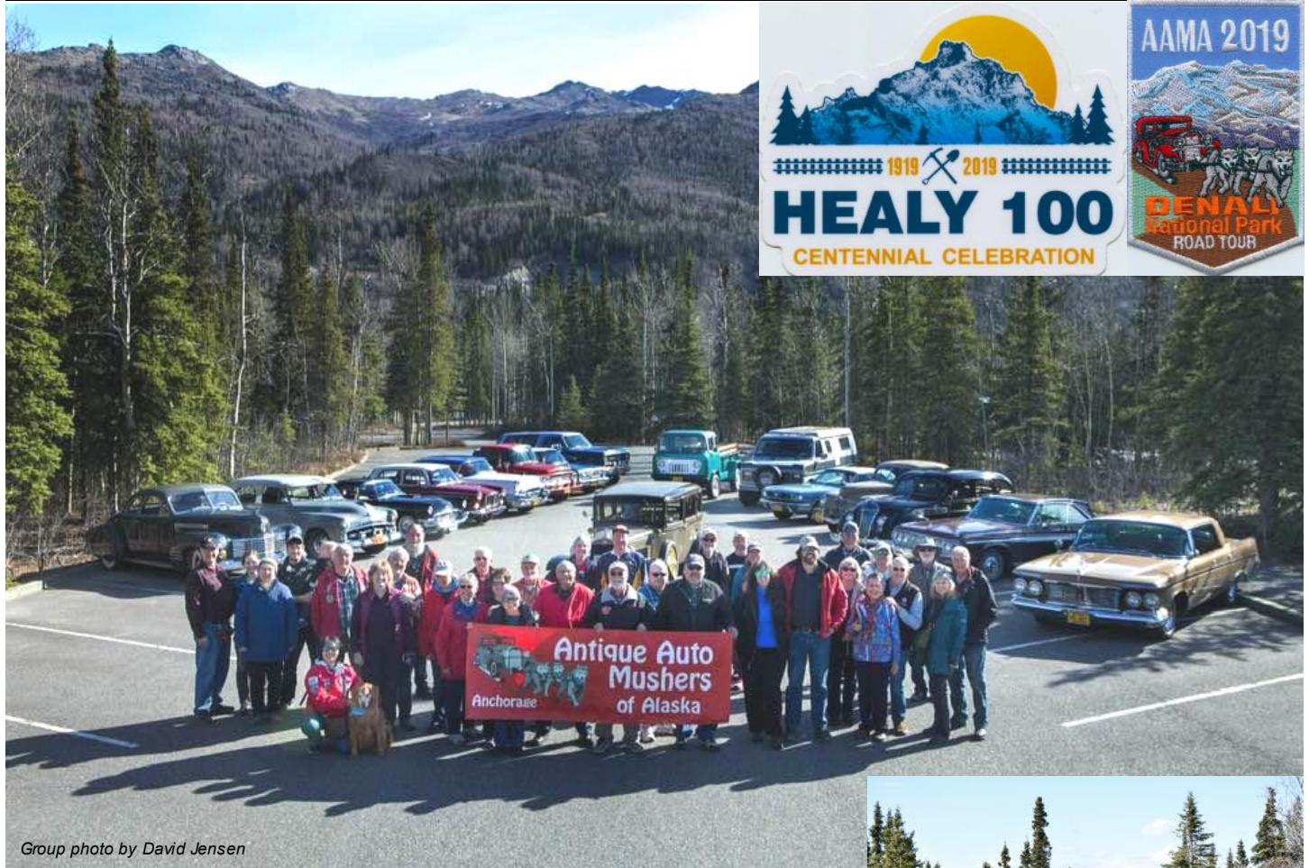
Group

Plateaus are the highest form of flattery.