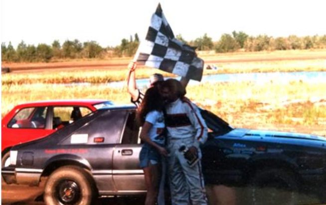
This is the Mustang that won the state championship 2 years in a row, the first year out won 18 out of 23 trophy dashes. I built this from an insurance job that burned the interior of the car with 9K miles on it.

For any auto fan, the Indy 500 is a bucket list must. No other car racing event in the world draws a larger crowd or a bigger party. We got hooked in 1998, and got season tickets for several years thereafter.