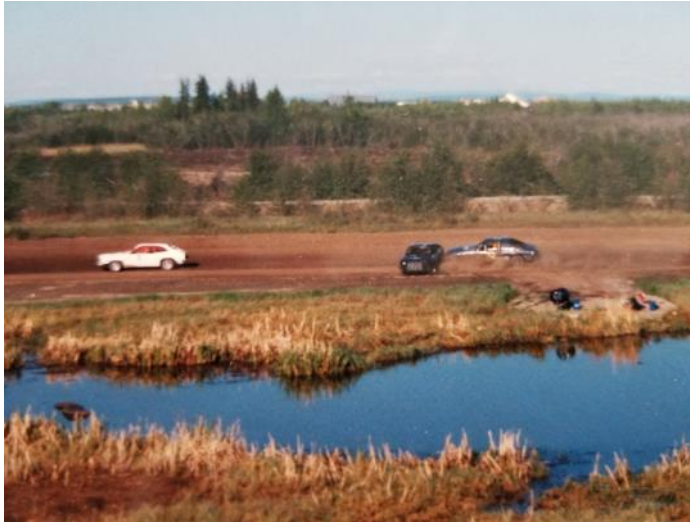
This is what real competition looks like, both of these cars were mine, and they took each other out, needless to say words were spoken in the pits, and both drivers spent many hours repairing cars for the next weekend.

It seems at a young age it began with a love of cars and little things to make them go faster and still stay dependable for the long run. In teen years it was a little street racing from time to time, but nothing seemed to spark my interest as much as dirt track racing.