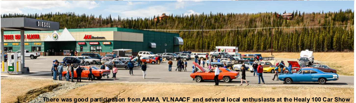
There was good participation from AAMA, VLNAACF and several local enthusiasts at the Healy 100 Car Show