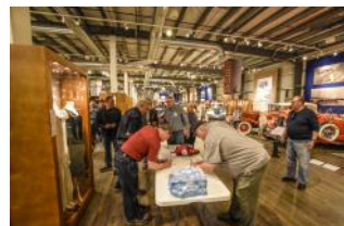
Members sign up to help with various jobs at the Carlson Car Show and/or to fill out entry forms for their cars after the meeting.