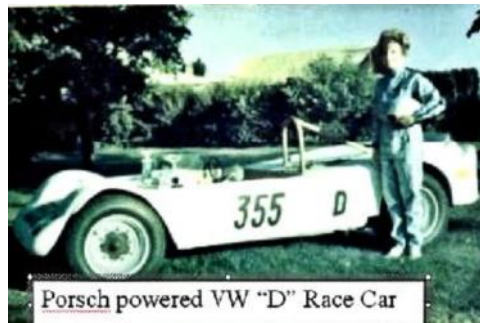
Porsch powered VW "D" Race Car