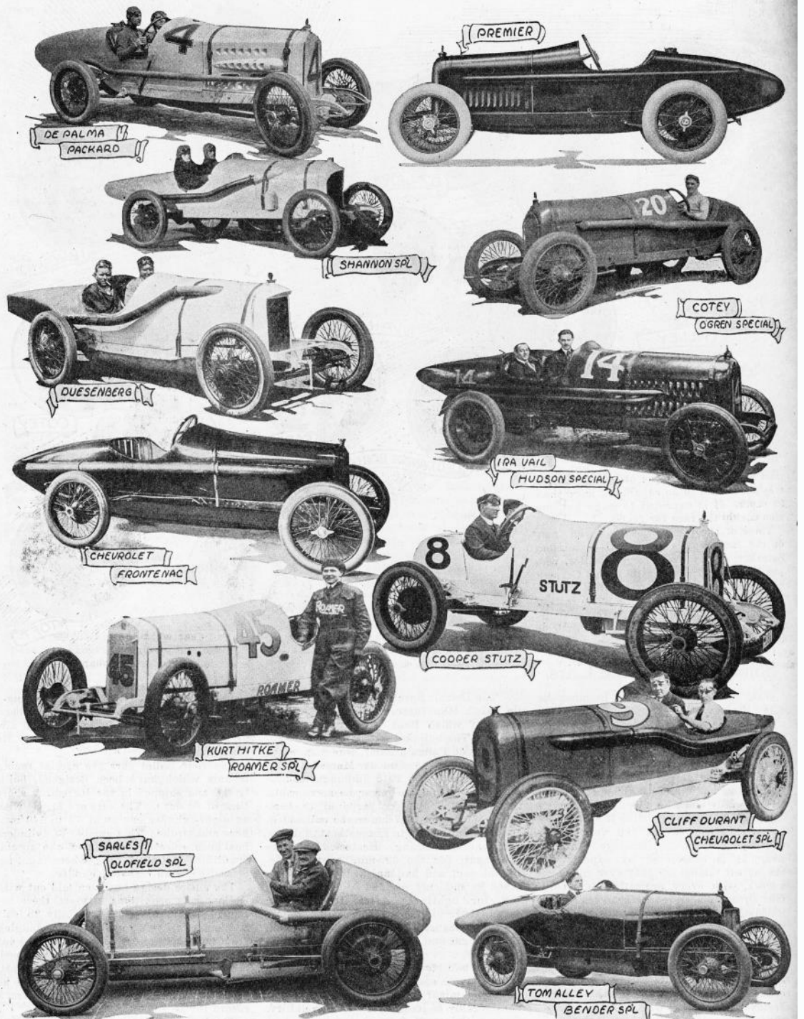
Some of the Cars Entered for 500-Mile

This newsletter is a publication of the Vernon L. Nash Antique Auto Club of Fairbanks, which is the most northern region of the Antique Automobile Club of America.