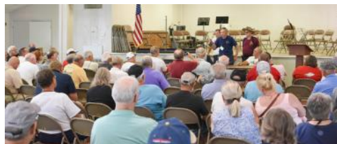
SDC Co-Operators Seminar