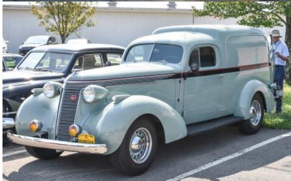
Top: Ford Stoeker's '37 Sedan Delivery at the Salmon Bake in Fairbanks in 2007. Bottom: same truck at the SDC Meet in Mansfield in September 2019.