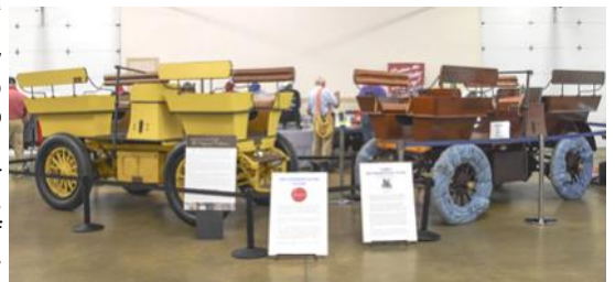
"Peg" and "Tommy" Capitol Electric Cars

NOS horn button for my 1963 Champ pick-up. Also housed with the indoor vendors was a display of the two Studebaker Elec-