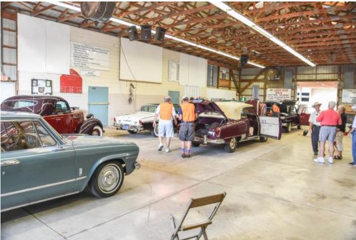
Point Judging was "drive-thru" indoors at the meet

I attended the Antique Studebaker Meet and the Studebaker Drivers Club International Meet in Mansfield Ohio in September. The Antique Studebaker Meet was mostly driving tours early in the week and then hospitality get-together at the hotel later in the week during the Studebaker Drivers Club (SDC) Meet, both the week of September 9th through 14th.