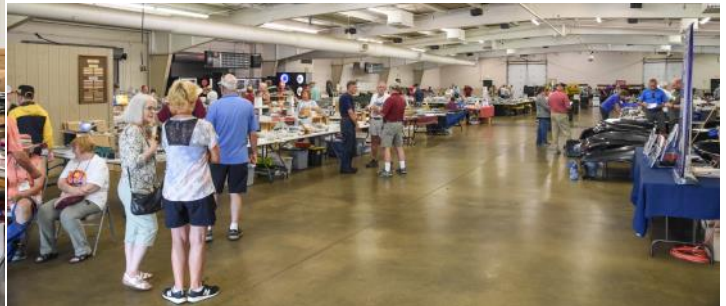
Two large indoor fair buildings for Studebaker vendors of all sorts, with more vendors and a car corral outside