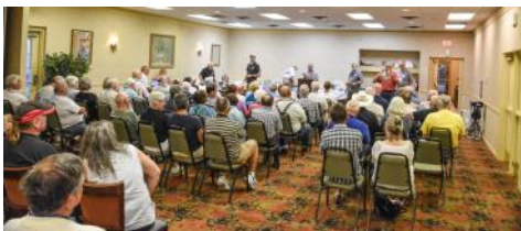
Antique Studebaker Club Auction