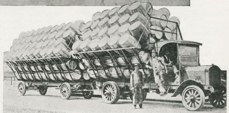
Above—Two trailers are used to transport long lengths of iron. Center—A trailer body built to seat 100 persons. At Right—Making a profitable trip load of very light material

This newsletter is a publication of the Vernon L. Nash Antique Auto Club of Fairbanks, which is the most northern region of the Antique Automobile Club of America.