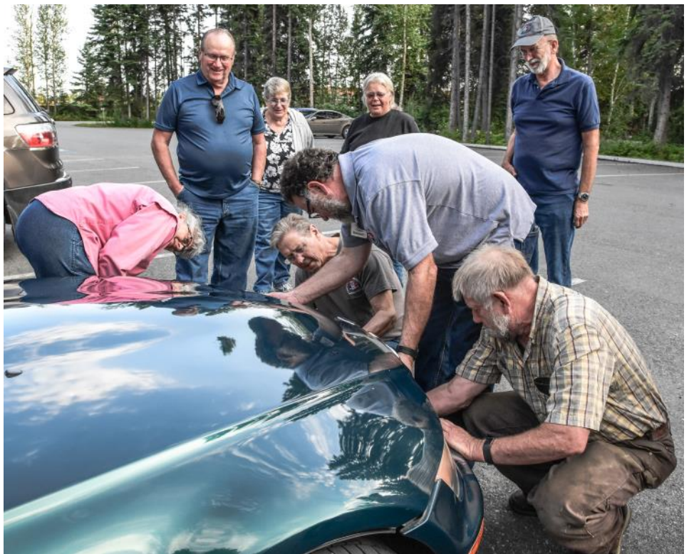
Even with a sexy raffle car like the Z3, these guys still can't get it up (the bonnet, that is...)