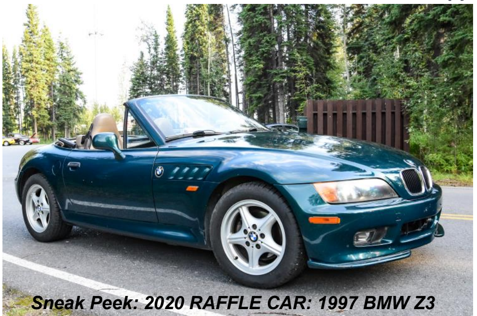
Sneak Peek: 2020 RAFFLE CAR: 1997 BMW Z3

Above, 1937 - by the 50's it was "I'm Earl Scheib, and I'll paint any car, any color for $89.95. No ups, no extras."