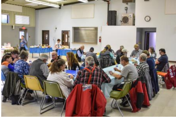
Right: Friday night pot luck dinner and Saturday noon lunch were held at the Tri-Valley Community Center.

er report PROMISED sun, so the Car Games started promptly at 10 am. This year we had the 1) Blind Target- where the driver had to watch his passenger guide him from the front of the vehicle to back up into a parking spot and end as close to the target as possible. The passenger could only use hand signals.