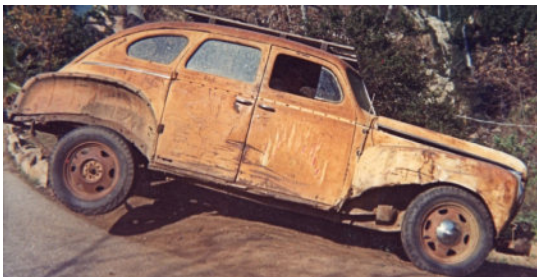
The car as stored in CA (before it was vandalized)

This incredible car should have been a national museum piece, but was simply stored in the Richardson's back yard - sadly unprotected. When the Richardsons moved from Chicago to Hollywood, California the coveted vehicle went with them and