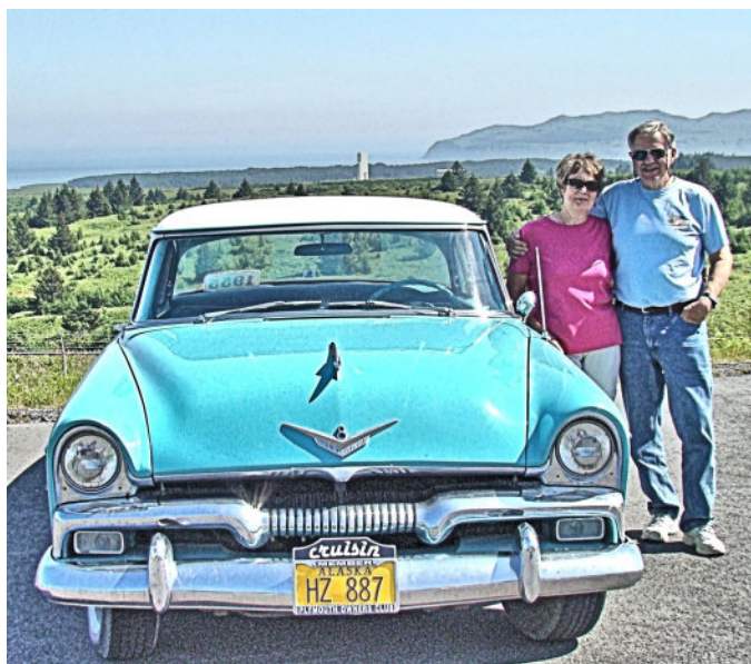
The Grundys on Kodiak - Missile Launch Tower in background.

The 2018 ferry schedule was just announced so there's plenty of berth and cargo space available. But space can quickly fill to capacity mainly with commercial vehicles now, and later with