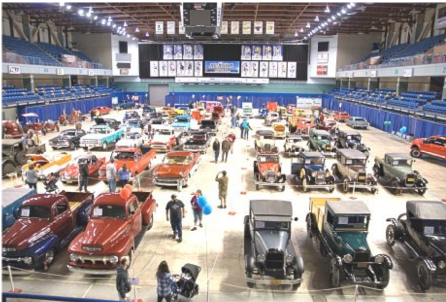
2016 Carlson Center Members Only Show

With Valve Cover Races coming up at The Carlson Show and at the Joint Meet, here is a rules refresher: