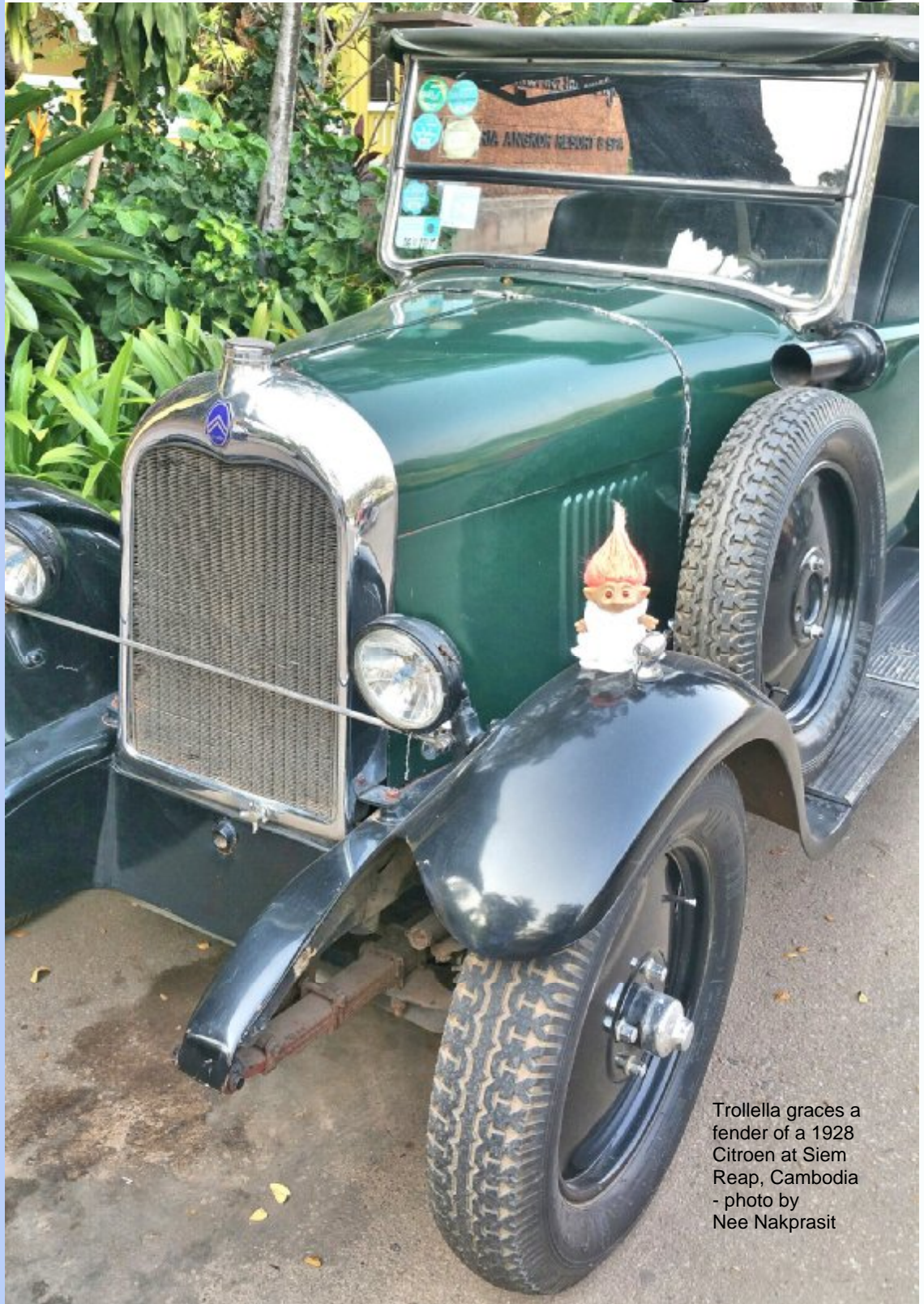
Trollella graces a fender of a 1928 Citroen at Siem Reap, Cambodia