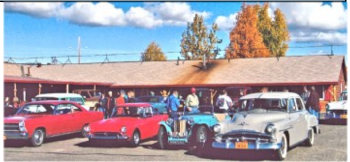
VLNAACF Cars at Chatanika Lodge, September, 2006

Our August 31 st Random Run-around will be called our "Apple Cider Run" celebrating the onset of autumn and the harvesting of one of America's favorite fruits- the apple. This will be a "flatland" tour for vehicles (and people) of all ages. Don't miss out on this Run-around adventure as the event can't go to press without your participation.