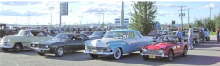
Pit-stop along the way...

Our tour of Fairbanks continued to A&W / KFC for an evening snack and social time. Thanks to all that participated in our Wednesday evening adventure and a special thanks to those that shared their hidden treasures to the club.