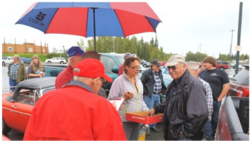
First card draw in the rain at Pioneer Park