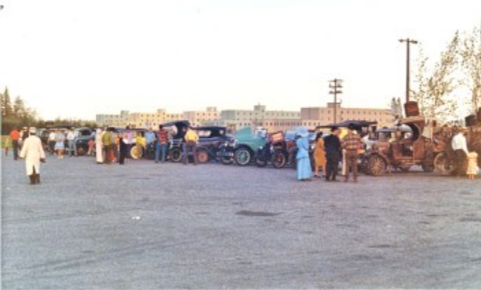
The club toured Fort Wainwright in July, 1971, and the group "was certainly well received by the military people". Once we arrived at the display area, the crowd gathered and showed loads of enthusiasm for our fine line up of "Prize Cars".

It would be remiss to not also report that the word marque is used in the US Constitution Article 1 section 8 wherein the congress is empowered to "declare war, grant letters of Marque and Reprisal". As such it was "a license granted to a private party to fit out an armed ship to plunder the enemy".