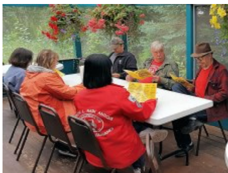
Members enjoy good food at the Mondo—see pg 10