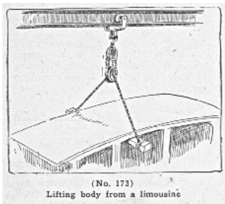
(No. 173) Lifting body from a limousine

These short cuts and repairshop kinks are taken from the 1918 book of the above title as published by the U.P.C. Book Company