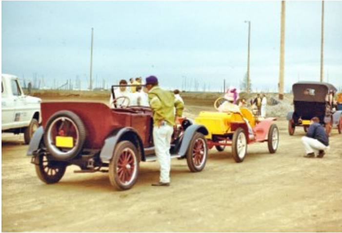
After the 1971 Golden Days parade, the group made a run to the North Pole Speedway, where they were given the track at half time to "show the crowd our prizes". In addition to having the fun of the tour and of showing the cars, the club was paid $5.00 for each car that was shown, pumping $50 into the club bank account.

This month from "The Rummage Box" Used with permission