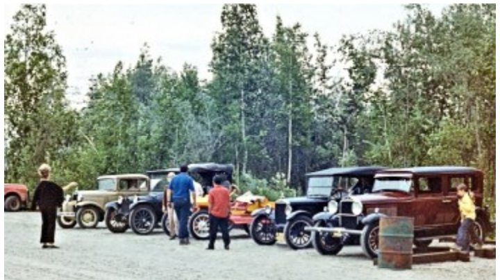
On July 7, 1971, the group had a picnic tour to Chena Ridge Campground. "Twelve cars, lots of people, great food and fine beer."