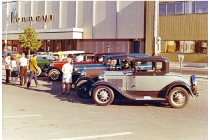
Cars gather in the JC Penney parking lot on June 8, 1971 for the first organized tour of the spring. Seventeen cars drove around Farmer's Loop to the Switzerland Restaurant for the club meeting, dinner, and a visit from two members of the Seattle-Tacoma Region of HCCA.