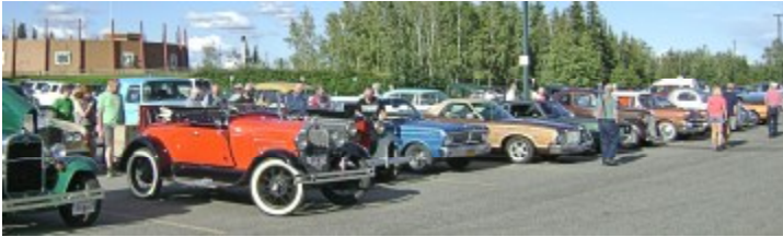
Cars gathered at Pioneer Park for the Random Run-Around

On Wednesday, July 27, 2016, our second-of-the-season Random Run-around combined a sunny summer cruise with a garage tour and backyard treasure exploration.