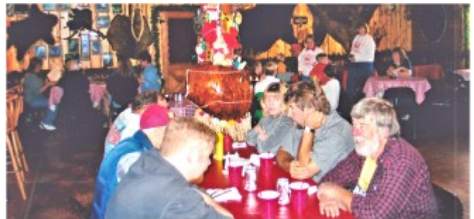
VLNAACF Members enjoyed the food 10 years ago at Chatanika

Our December meeting & party is early this year, Dec. 11th.