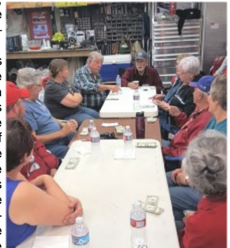
"Left—Right—Center" was a new game of pure chance that stirred some competitive spirit, even though it was only the luck of the dice roll and only a very small ante.

While most of us were trying to figure out what kind of an old car game this might be, she brought out sets of three dice. The game was a dice game which was pure chance, but the interaction with passing one of your three dollars stake to the left, right, or into the center pot, made for fun, and sometimes contentiously fun interaction!