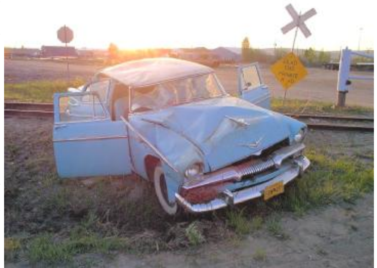
Fairbanks Police Department File Photo of the Accident