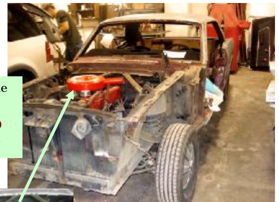
Note the freshly painted air cleaner (thanks, Ross! - and thanks for the pictures, too)

push their ride over there for quality body work”. Ross Beal has been shepherding our car through the process of getting fixed up for the raffle, and he has supplied us with some pictures.