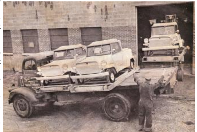
To remove the car from the crate, remove only the two cross pieces from the crate at the rear of the car and also remove the board above the rear bumper. Remove the hold-down wires that secure the front of the car to the crate. The car may then be rolled out the back of the crate.