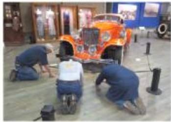
Not to be outdone...