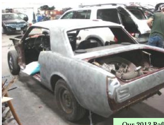
Car almost ready for paint this week at Seekins Body Shop