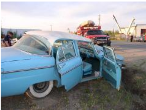
Fairbanks Police Department File Photo of the Accident

On the fateful moment of 10:24 p.m., on 29 June 2006, an inebriated Dick Sleep rolled his nearly perfect 51 year old car at high speed on Phillips Field Road in a single car accident. Dick only suffered a few scrapes and bruises but the car didn't fair nearly as well. All four door pillars were damaged and the roof, windshield, hood and right front fender were beyond repair. The remainder of the vehicle, including the doors, was filthy but in