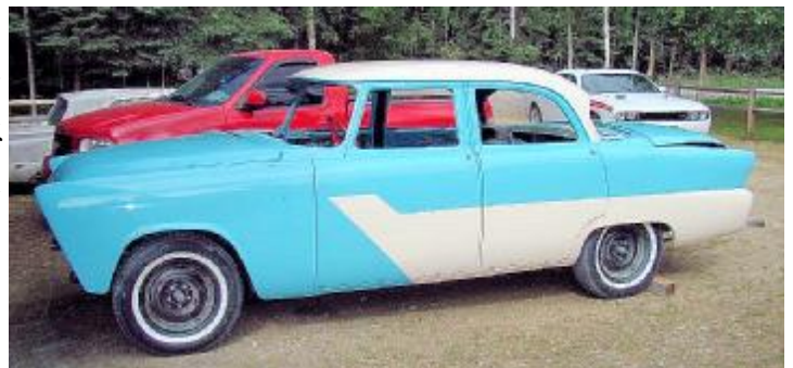
Repainted and "ready to roll"! - Read How in the May Issue...

Well, over the years the more I looked at Sleeper the more impressed I became. Its trunk and floors, for example, were rust free. Plus it had power steering and other factory options that made her even more appealing. I wanted this Fairbanks car to survive. I sought the advice of at least three knowledgeable members of our club; all were gentle but united that the car was too far gone to prudently rebuild. The Plymouth Owners Club advisors for the 1955 & '56 Plymouth also stated it would not be practical to go to great expense to rebuild a four door. My wife continued to be adamant in her opposition and exclaimed, "Why do we need an identical car to one we already own that is a proven and dependable driver?" I didn't have a good response. TO BE CONTINUED IN THE NEXT ISSUE: