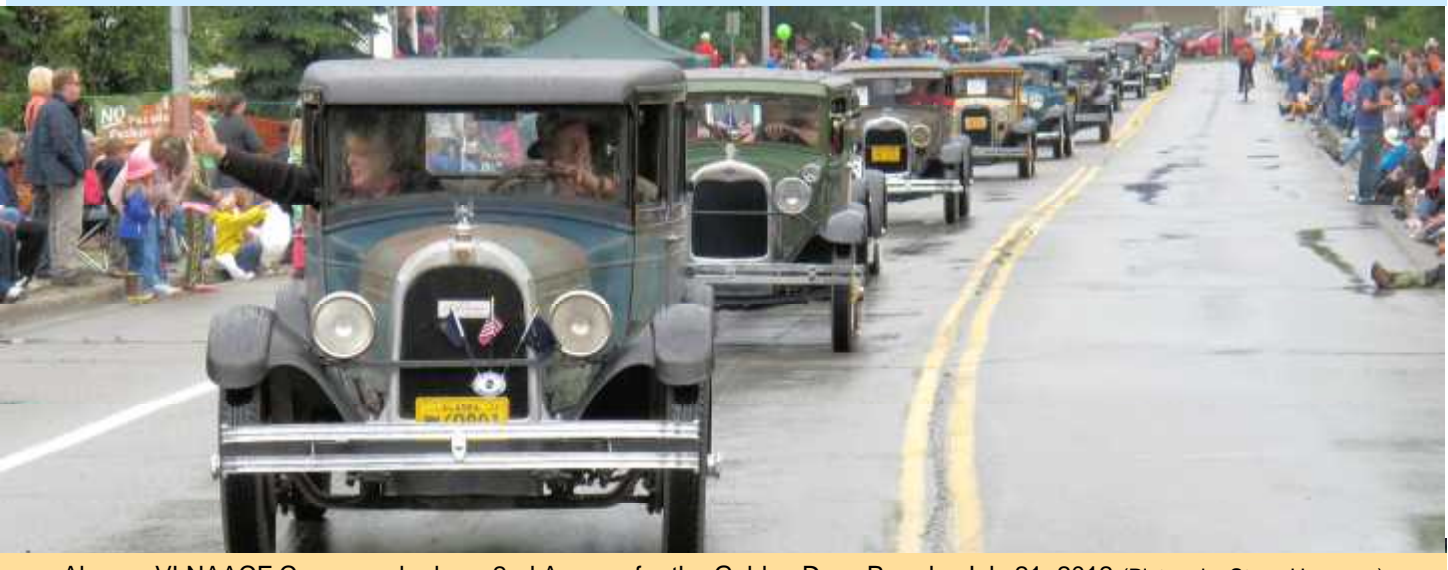
Above: VLNAACF Cars parade down 2nd Avenue for the Golden Days Parade, July 21, 2012