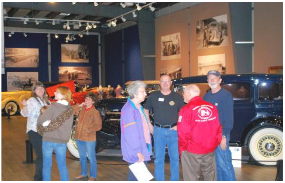
After the meeting, many folks took time to tour the museum and to visit. The '32 Cadillac Limo with the V-12 was one of the magnets around which folks congregated.

on Sundays and on summer weekdays when tourist traffic is high. There are many new cars on display, and a number of folks were interested in the new electric car additions to the collection.