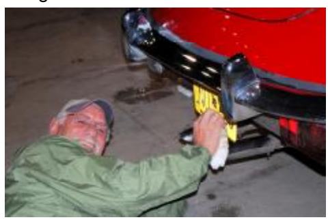
Detailing: Kelly Rivers even does the license plates before the Carlson show

Vender participation was good, as Charlie Bourque did a great job gathering some fantastically big door prizes (chain saws, floor jacks, etc.), and a number of the display vendors had good interest— Jose's custom cars were a big hit.