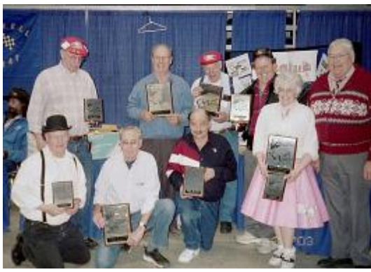
2003: First of the current Carlson Center Show Winners.