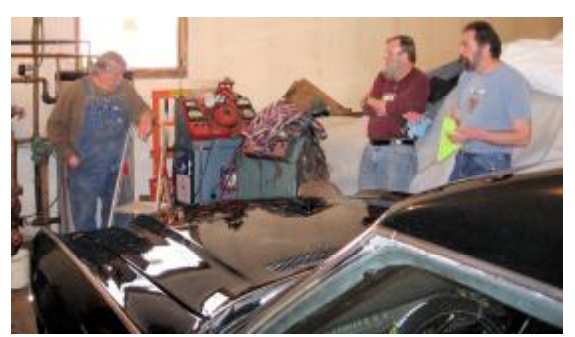
FINAL CONFERENCE—and the judgement that "it is ready for the show"...

Hello Everyone: We had another good work day with six people showing up. We were able to finish all the items on our task list (polishing bumpers and side trim, installed rear view mirror, installed speakers and grills, cleaned the windows, applied a soft coat of wax and vacuumed). We ended the day declaring victory since no more work sessions will be required. The very few detailing items that remain (e.g. shine the tires) can be handled by an individual or two when they take the car to club events and other venues. The car still needs the following items: chrome lock pulls for both doors, rim with spare tire, jack, lug wrench and under-hood vent intake cover. If anyone in the club has any of those items we would appreciate a donation. Cheers, Terry Whitledge