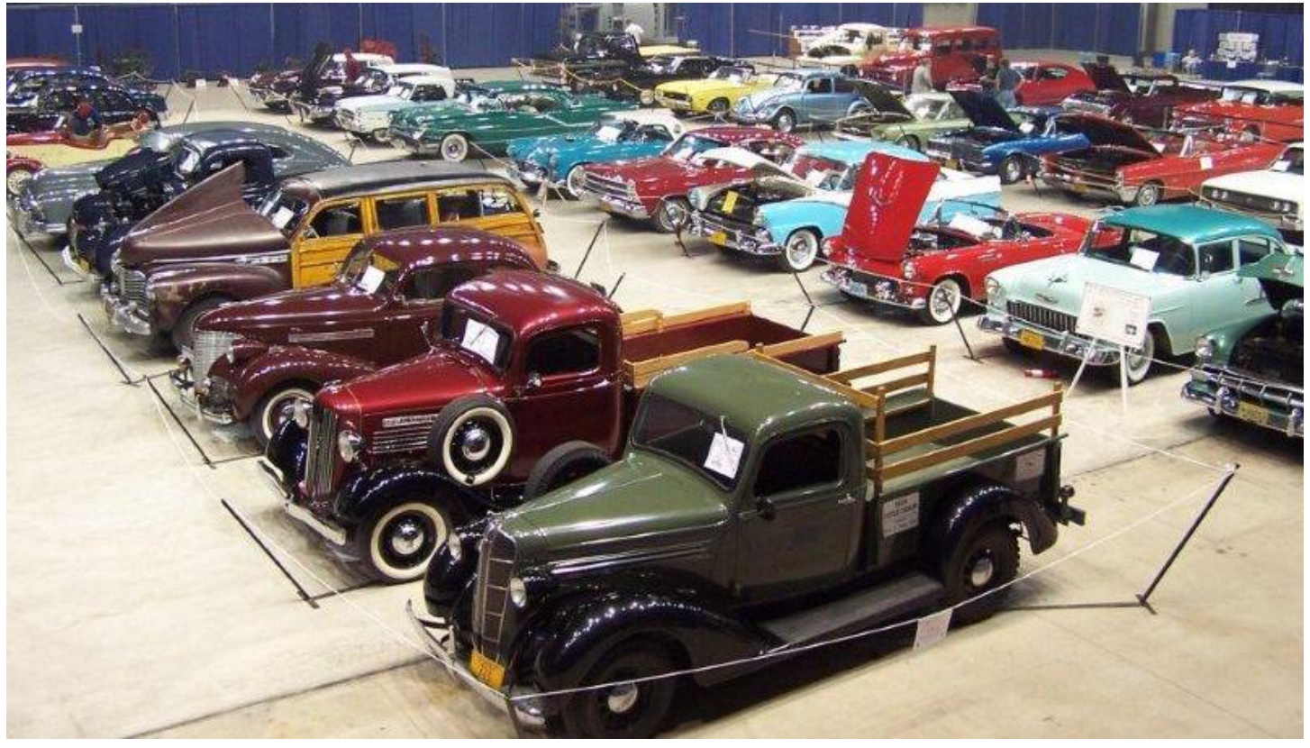
The Second Carlson Center Show (2004) - Every year grows and changes—get your car registered NOW!

The Carlson Center Members Only Show is this month—but the club has a long history of car displays and shows.