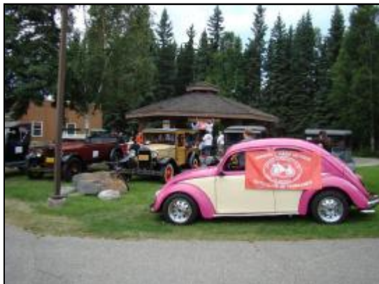
The winner of the Bug