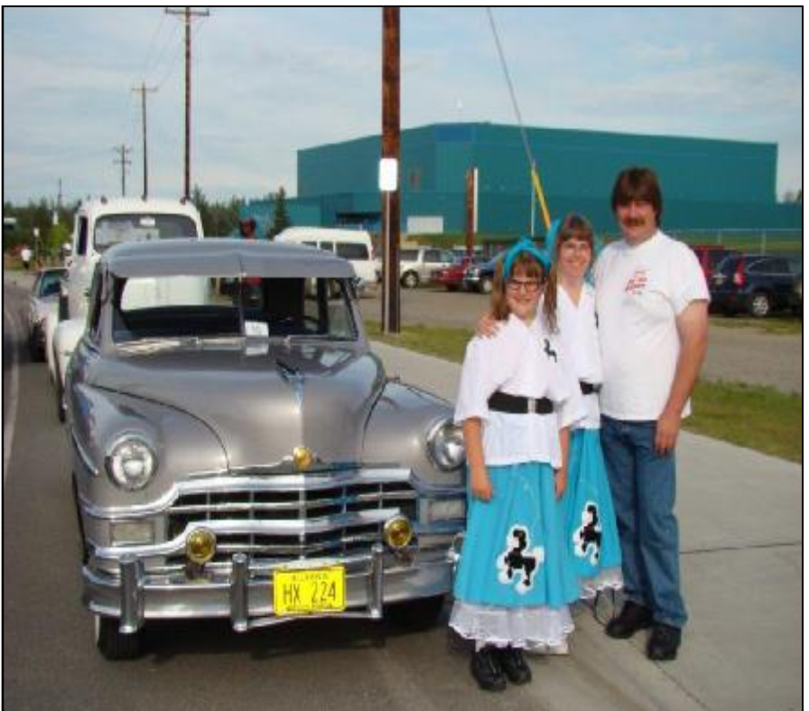
Some of our Club Members, Their Cars, And Families