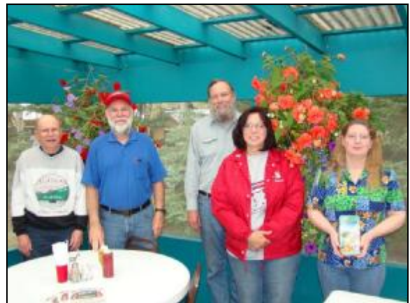
Left: The Group taking a pit stop at The Gold Hill Express