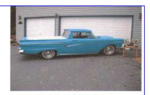
1957 FORD RANCHERO "A CLASSIC RESTORATION"

Model 66 B w/25K Miles on Driveline 302 V-8 Engine w/C-4 Automatic Transmission Power Brakes (front disc) & Cruise Control Turquoise Exterior w/White Roll & Tuck Interio Electric Wipers--Tinted Glass--Padded Dash Ground Effects Lighting---Tonneau Cover A Great Cruiser and a Multiple Trophy Winner