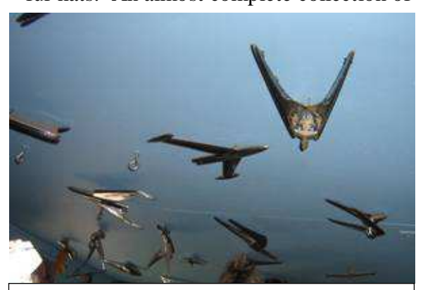
Hood Ornament Collection

that catches the eye. The ceiling is adorned with classic and antique hood ornaments and fur hats. An almost complete collection of