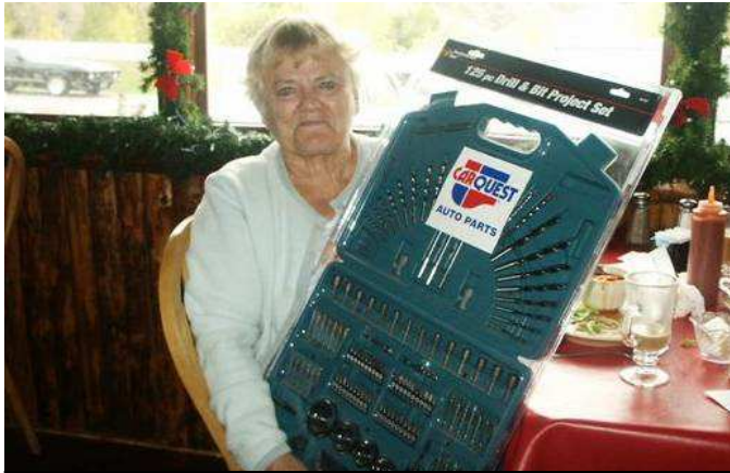
“Just what I wanted!!” Many thanks to Car Quest for their generous support of VLNAAC.

menus)... (Note to self, make sure that the answers to your trivia game can't be found on the menu of the restaurant you choose to eat at!!)