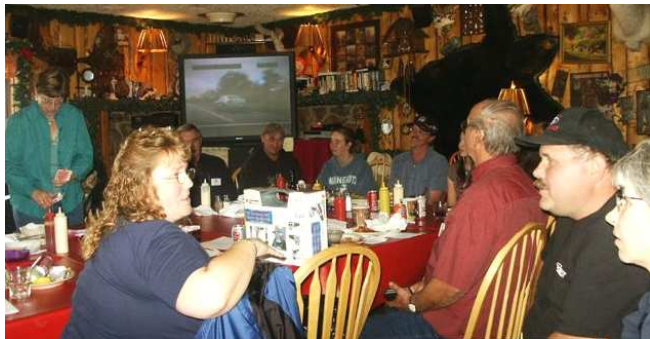
VLNAAC members enjoy camaraderie and a meal at the Chatanika Road House