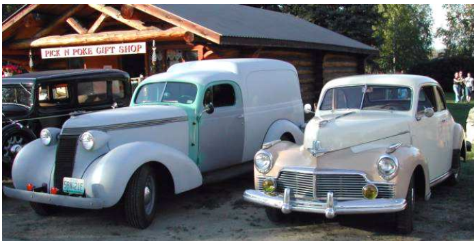
1937 Studebaker President Sedan Delivery and a 1946 Studebaker Champion Business Coupe