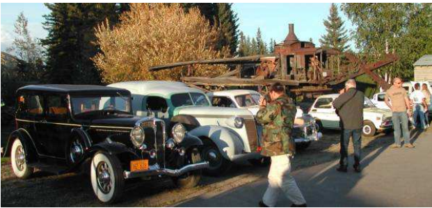
Studebakers get lots of attention at Pioneer Park