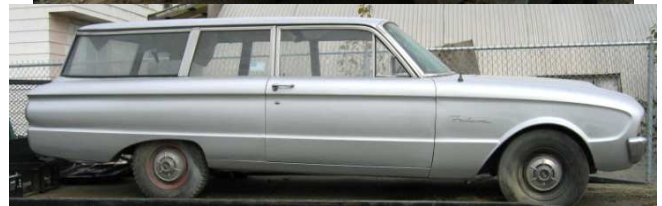
Recommended Raffle car: 1960 Falcon Wagon