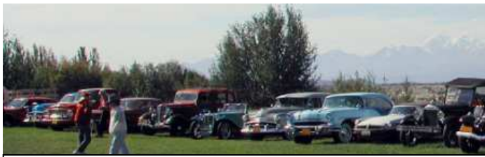
A beautiful day the banks of the Tanana River near Delta