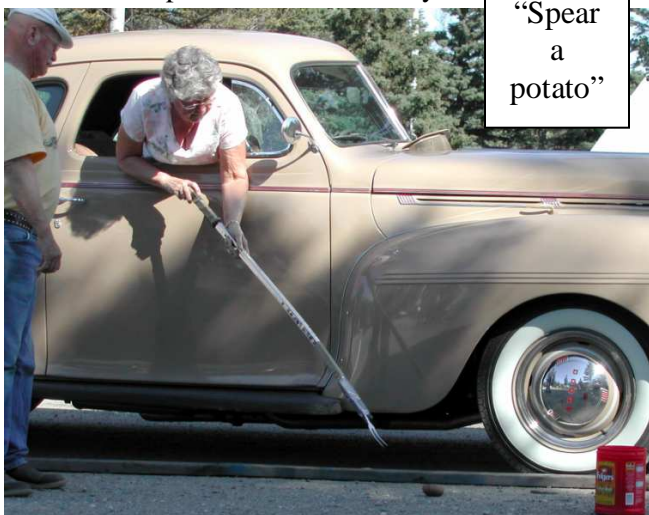
"Spear a potato"