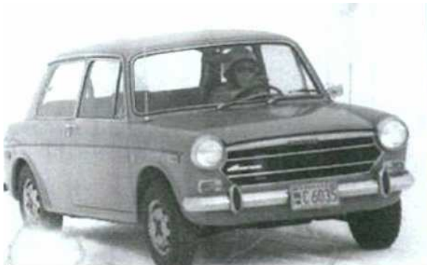
Ice Racing in an Austin America