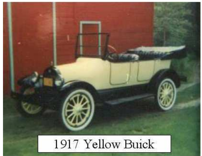
1917 Yellow Buick