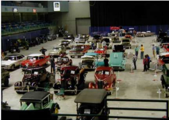
Photo is of the 2005 Car Show. Let's make the 2006 Car Show even greater. The fun includes the excitement of an antique truck raffle, camaraderie with friends, and showing off your antique and classic cars and trucks.

The Carlson Center VLNAAC Car show is June 3 and 4. Applications for signing up are available from our President, Willy Vinton, 474-0939 or stop by Northern Truck Center. There is a signup fee of $5.00 this year to help defray the cost of 24 hr security. Lineup will start at 5:00 PM, June 2 nd in the back lot of the Carlson Center. As has done in the past, we will line up outside and go into the Carlson Center arena by year. Please have gas tanks almost empty and have fire extinguishers for each vehicle.