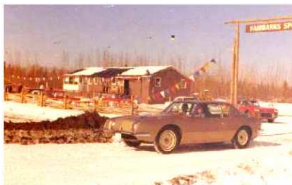
Merle's Avanti in a Rally leaving the Fairbanks Sports Car Club House located behind present day Carlson Center. Note club sign top right.

loved this car and looked at it every day since the only barrier separating her office from the showroom was a counter. Finally in January 1964 she threw caution to the wind and purchased it for $5,300, a large sum of money for a car at that time.