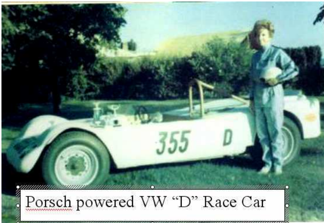
Porsch powered VW "D" Race Car